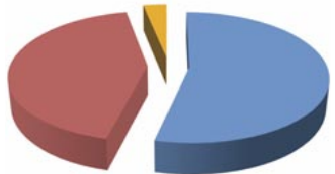
53.8% ● Fees 43.0% ● Government Funding 3.2% ● Other Income

Other income of $1.209m made up the remaining 3.2% of revenue.