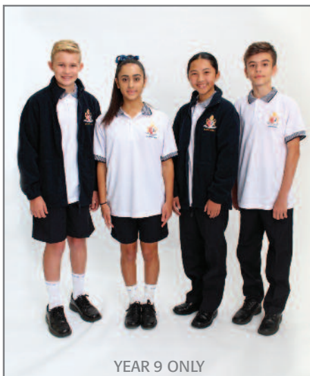
YEAR 9 ONLY