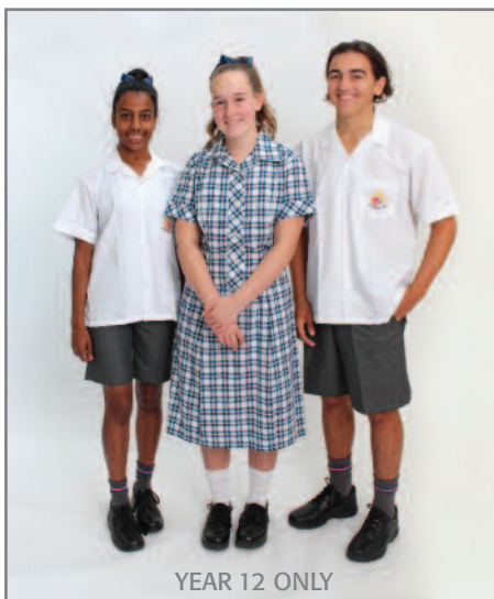
YEAR 12 ONLY