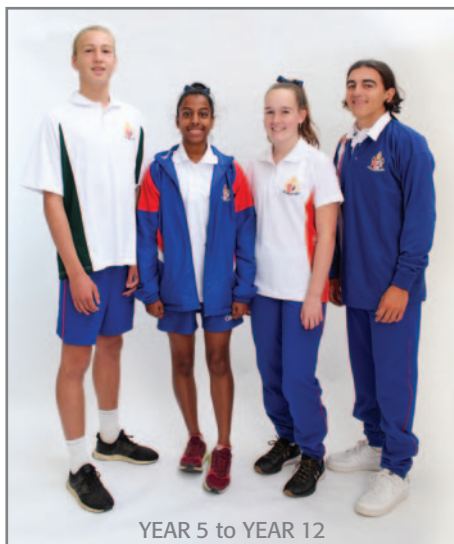
YEAR 5 to YEAR 12