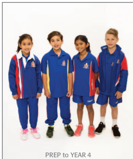
PREP to YEAR 4