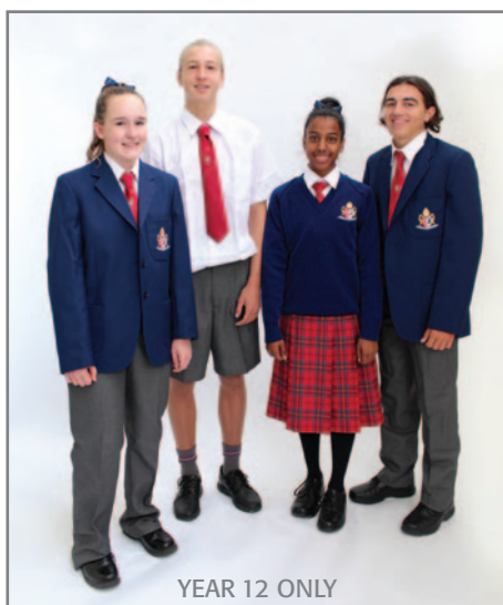
YEAR 12 ONLY